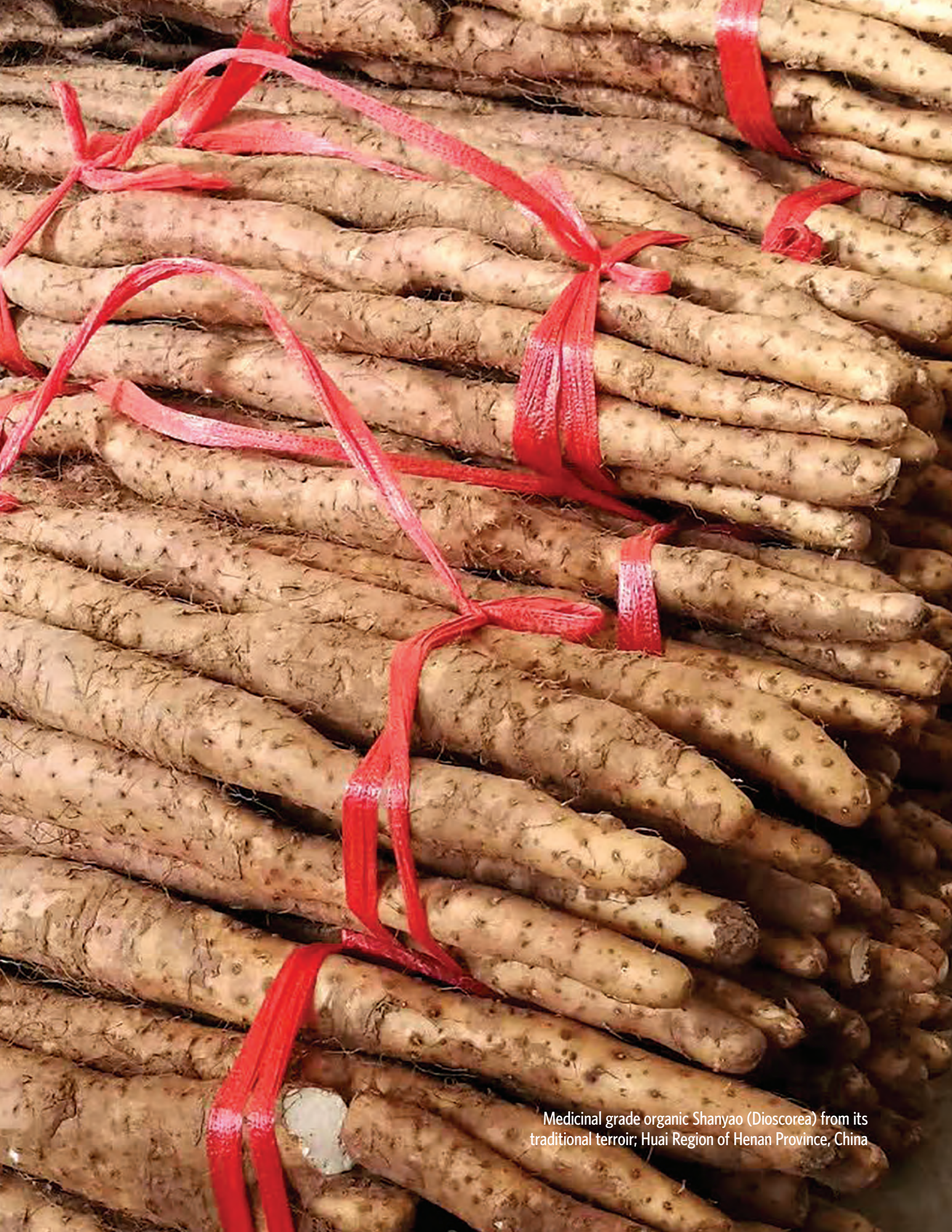
Medicinal grade organic Shanyao (Dioscorea) from its traditional terroir; Huai Region of Henan Province, China