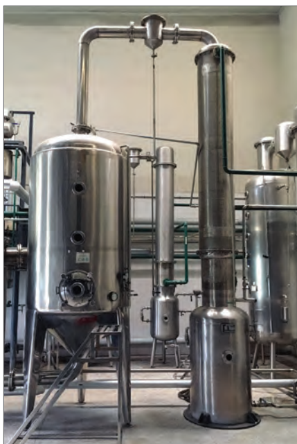
DECOCTION TANKS FOR ACHIEVING 10:1 CONCENTRATION OF HERBS; GMP PROCESSING FACILITY IN CHINA

All herbs are processed according to the labor and cost intensive methods specified by the classics of Chinese medicine and relevant paozhi teachings of traditional family lineages.