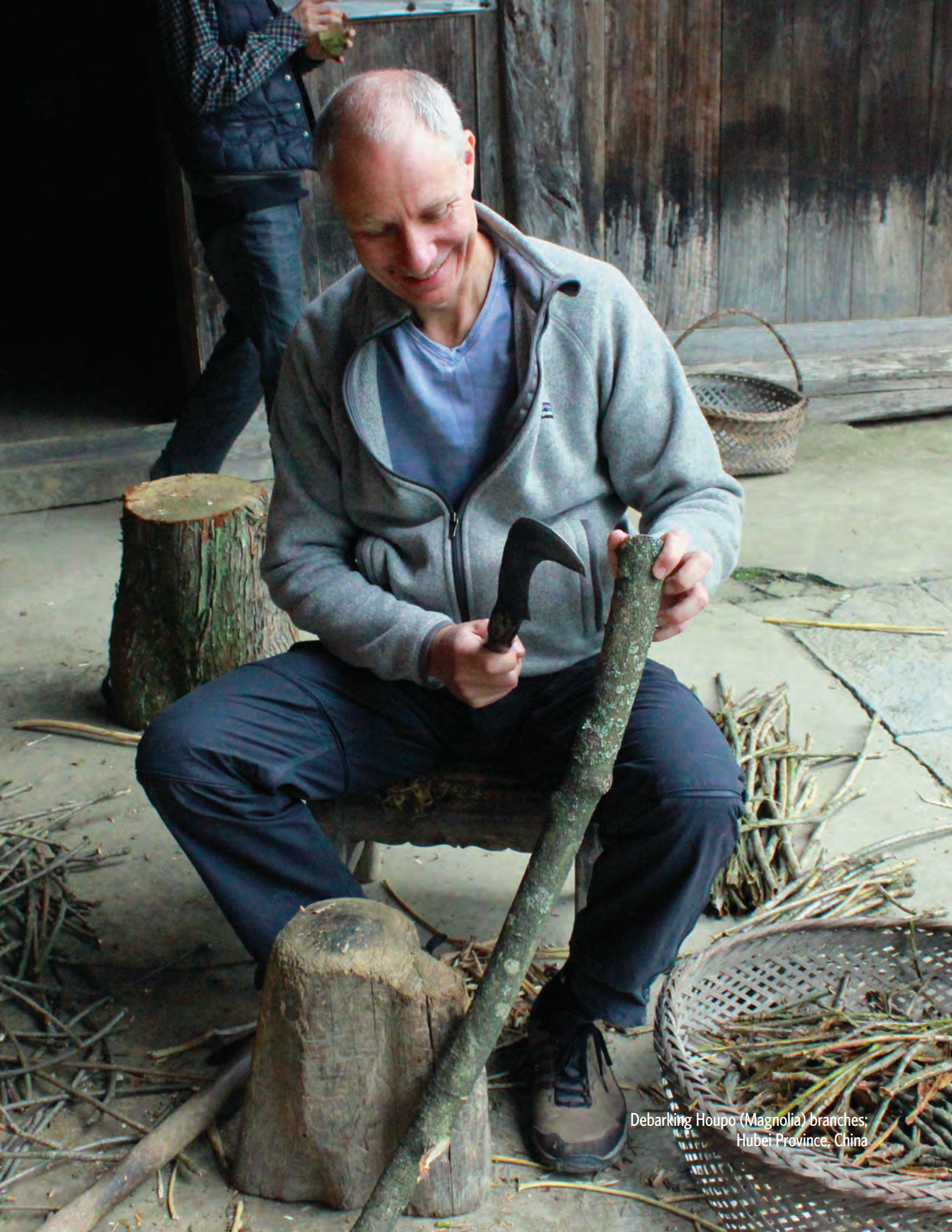
Debarking Houpo (Magnolia) branches; Hubei Province, China