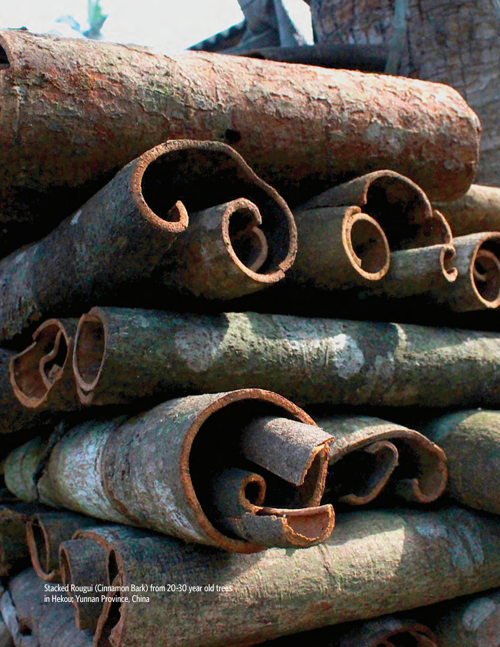
Stacked Rougui (Cinnamon Bark) from 20-30 year old trees in Hekou, Yunnan Province, China