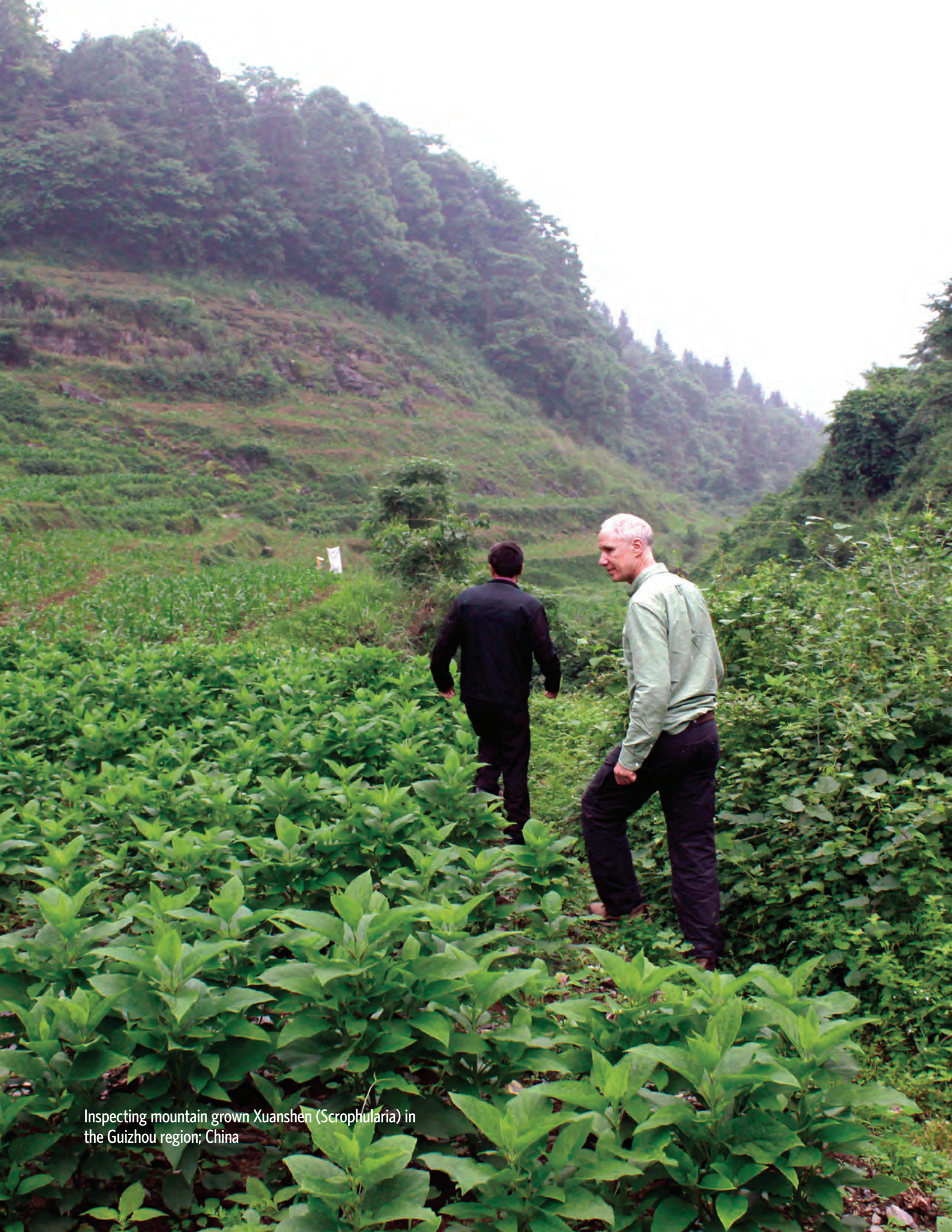
Inspecting mountain grown Xuanshen ( Scrophularia ) in the Guizhou region; China