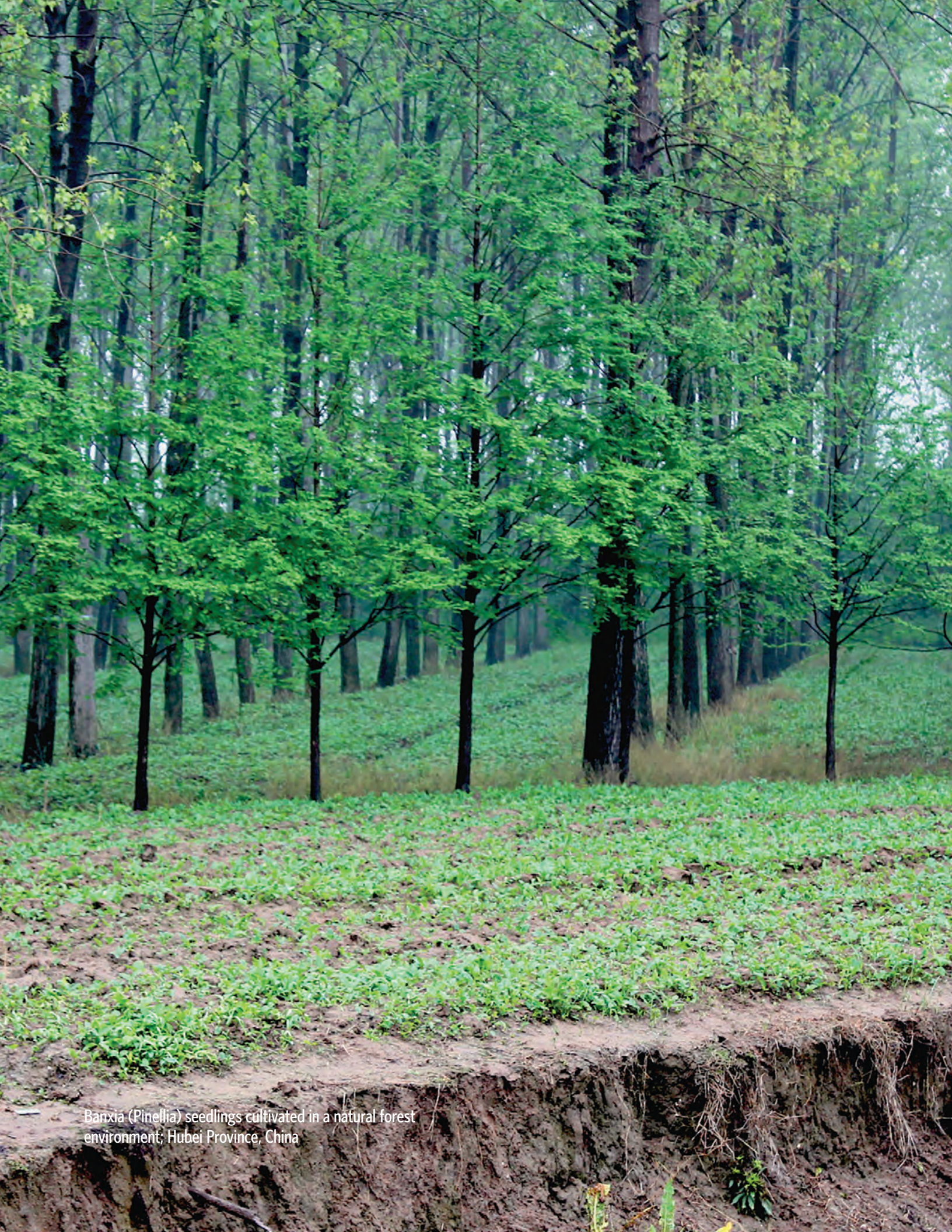
Banxia ( Pinellia ) seedlings cultivated in a natural forest environment; Hubei Province, China