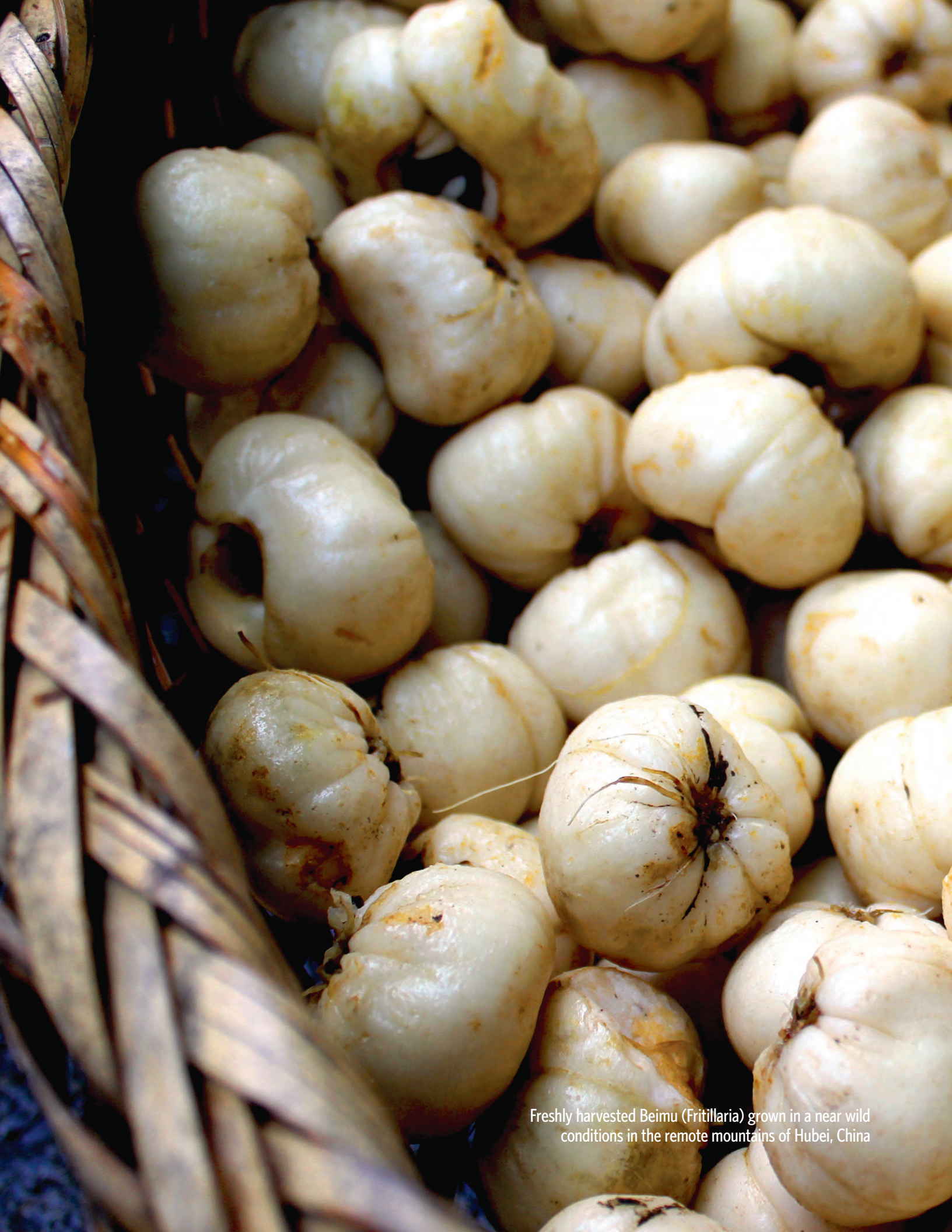
Freshly harvested Beimu (Fritillaria) grown in a near wild conditions in the remote mountains of Hubei, China