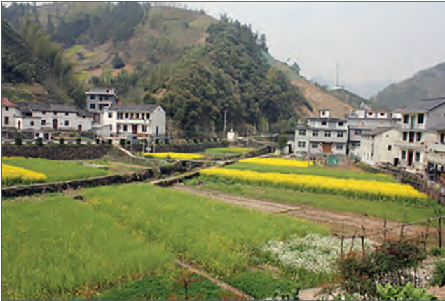
SMALL SCALE HERB FARM IN THE MOUNTAINS OF HUBEI

The quality and purity of the herbs is of the utmost importance to Classical Pearls. The potency of the formulas and single herbs - and the efficacy of your treatments - depend on this notion.