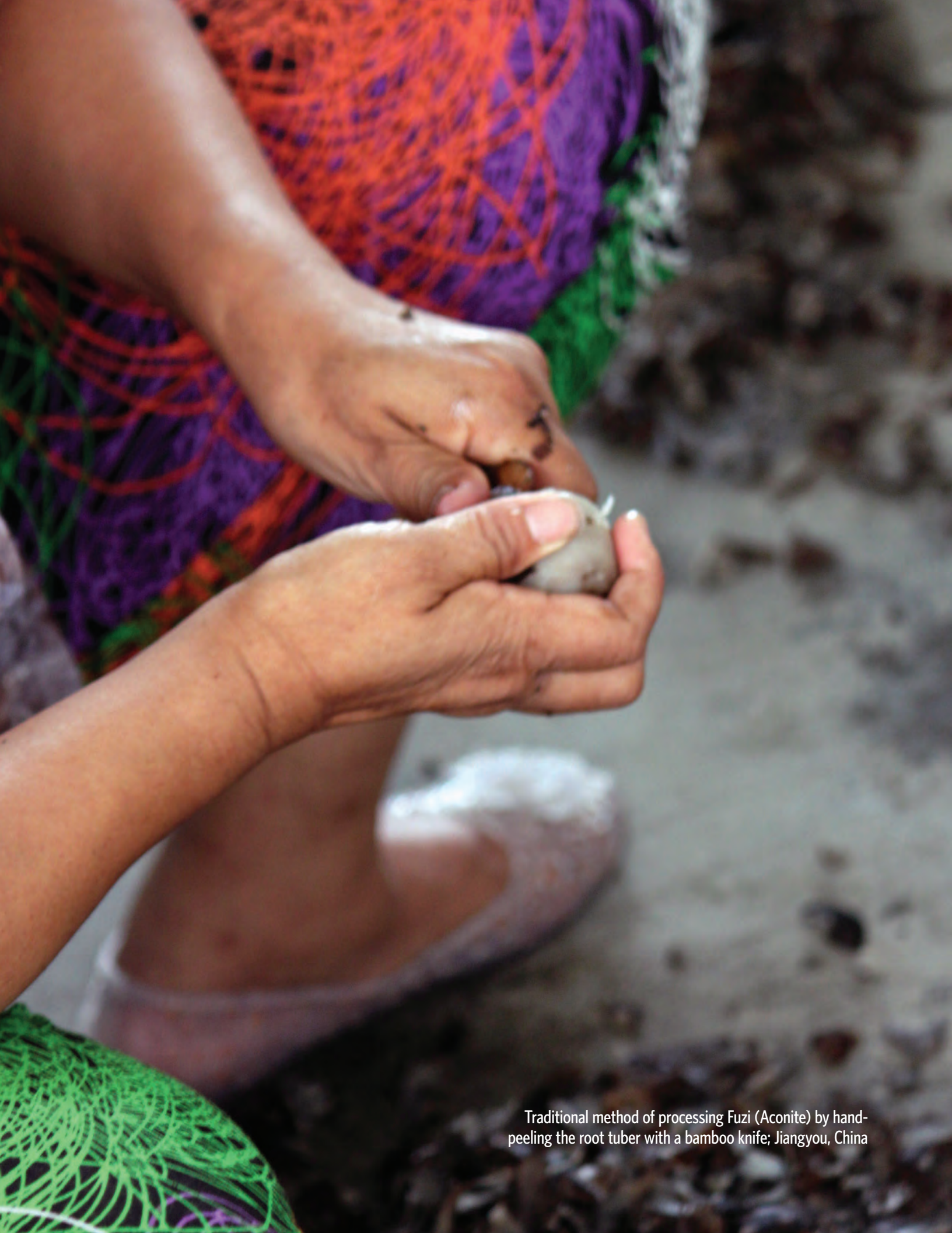
Traditional method of processing Fuzi (Aconite) by hand-peeling the root tuber with a bamboo knife; Jiangyou, China