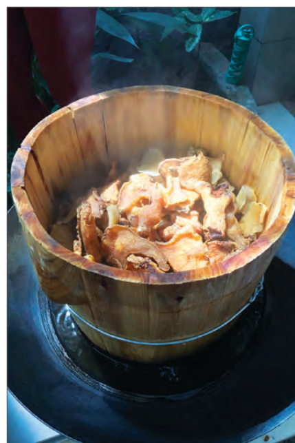
HUANGJING (POLYGONATUM ROOT) BEING STEAMED NINE TIMES ACCORDING TO TRADITIONAL PAOZHI PROCEDURES SPECIFIED FOR THIS HERB

Like so many other techniques spawned by the wisdom traditions of ancient China, genuine paozhi has become a dying craft. Up to the end of the 19th century, classical prescriptions used to differentiate processing instructions for most of their ingredients. Nowadays, most Chinese medicine physicians don't know how to prescribe processed herbs anymore; most pharmacies do not carry them, and most herb distributors cannot provide them. Even professional paozhi facilities tend to limit their services to procedures