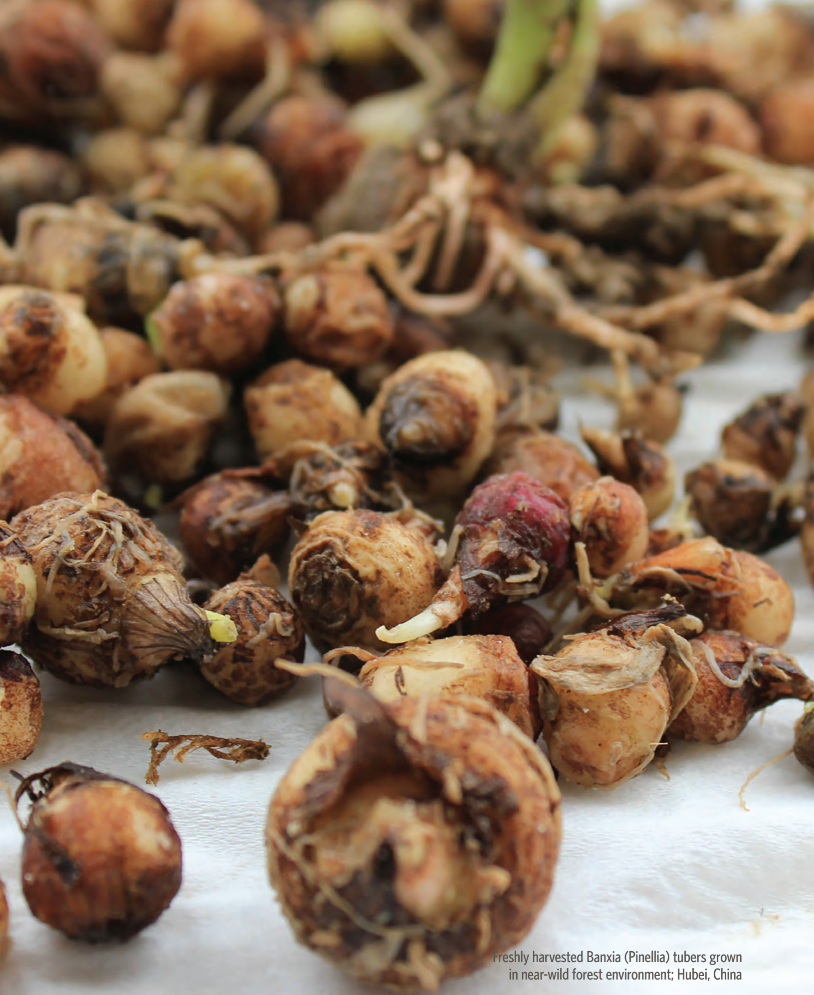
Freshly harvested Banxia ( Pinellia ) tubers grown in near-wild forest environment; Hubei, China