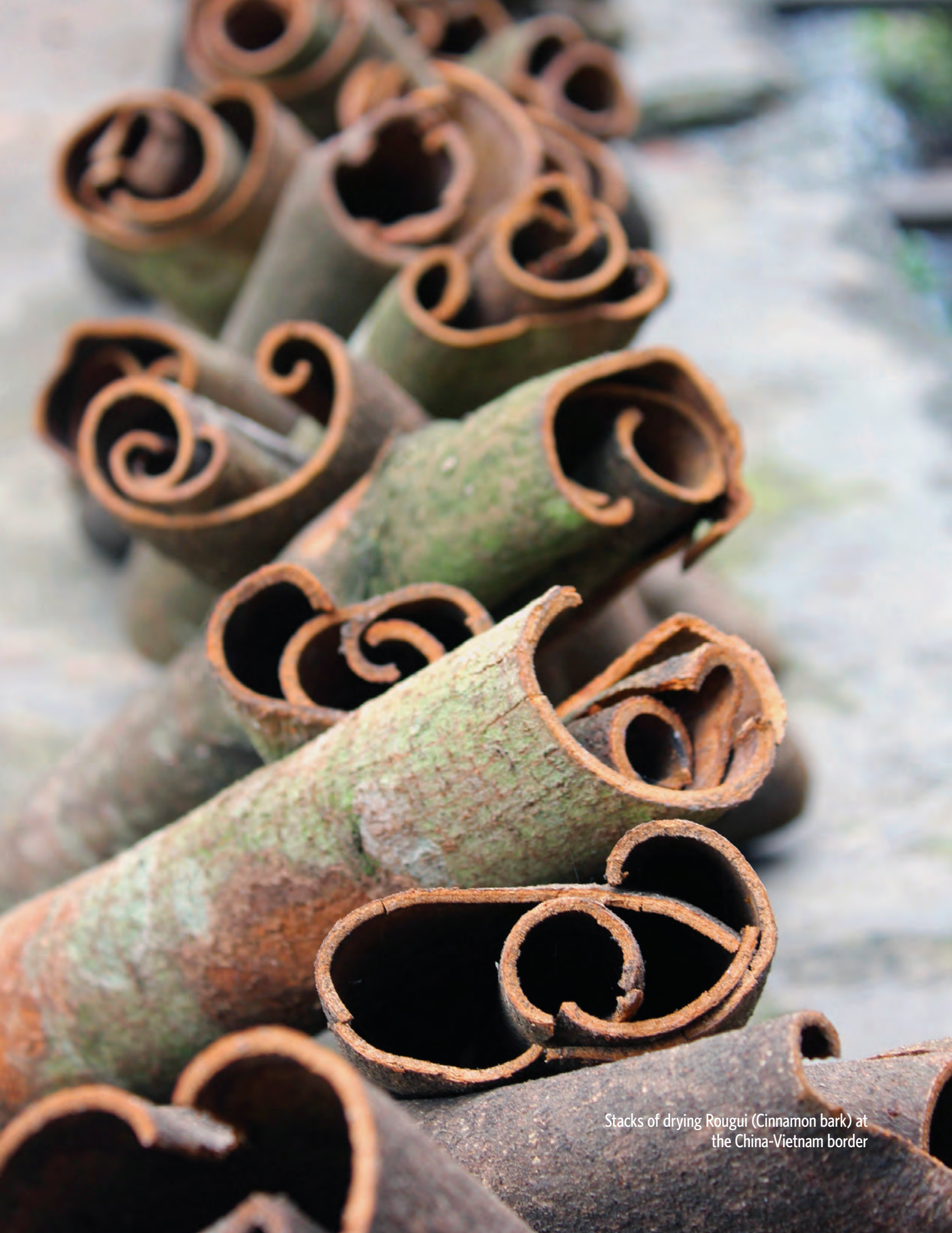
Stacks of drying Rougui (Cinnamon bark) at the China-Vietnam border