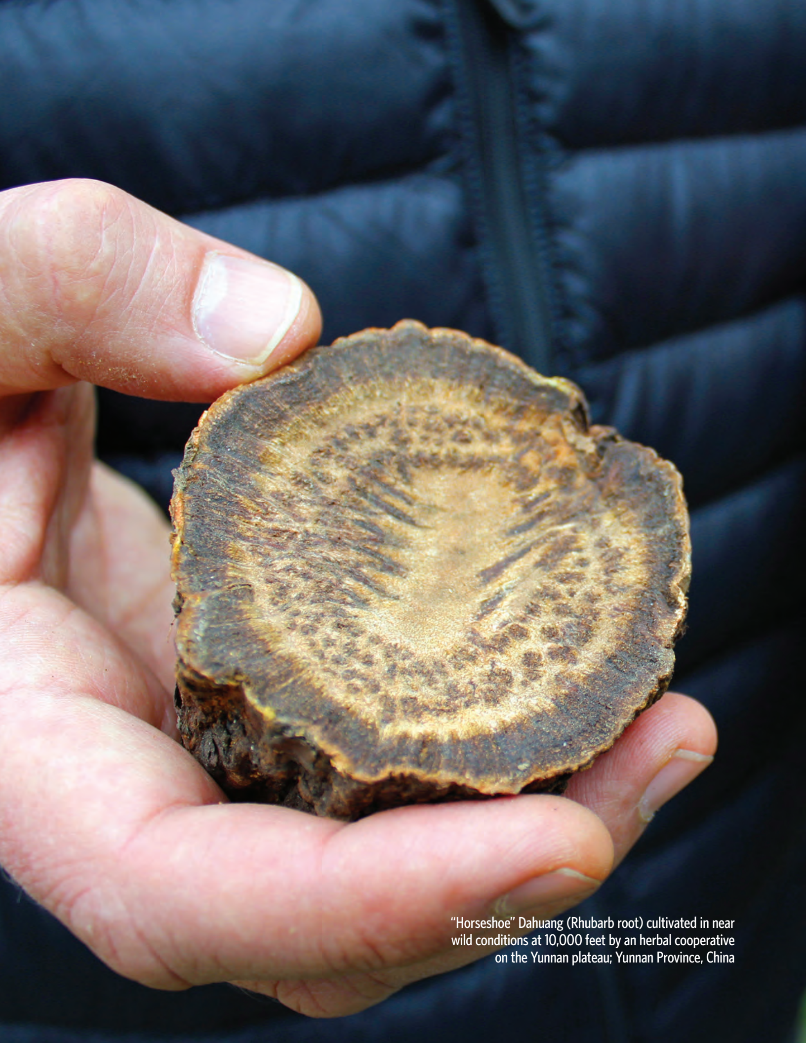
"Horseshoe" Dahuang (Rhubarb root) cultivated in near wild conditions at 10,000 feet by an herbal cooperative on the Yunnan plateau; Yunnan Province, China