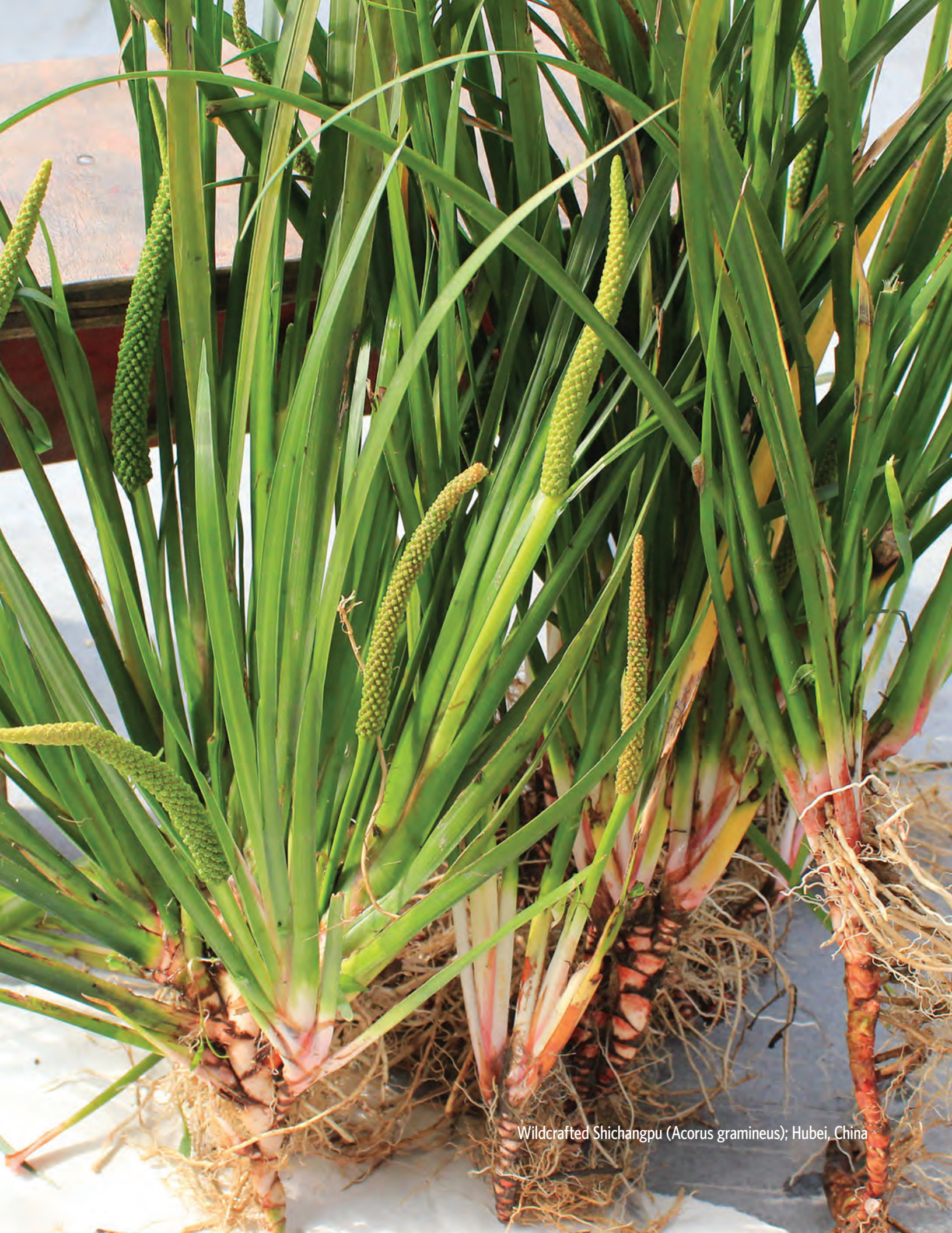
Wildcrafted Shichangpu ( Acorus gramineus ); Hubei, China