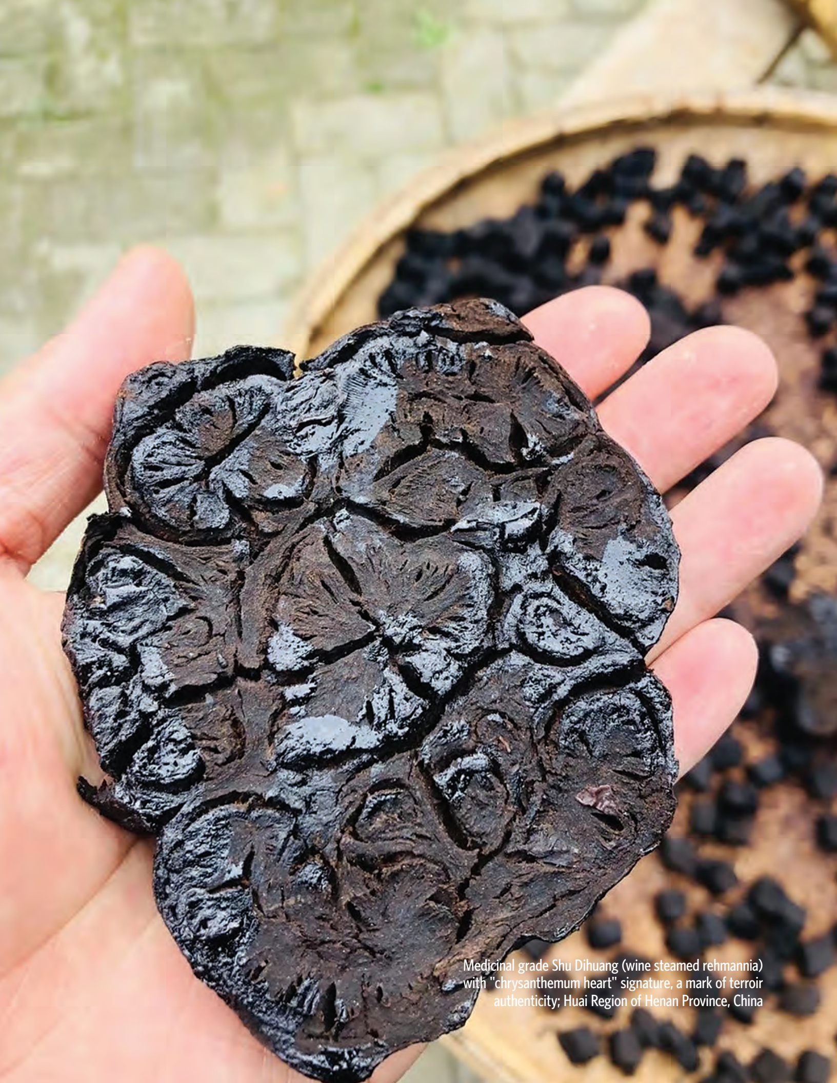
Medicinal grade Shu Dihuang (wine steamed rehmannia) with "chrysanthemum heart" signature, a mark of terroir authenticity; Huai Region of Henan Province, China