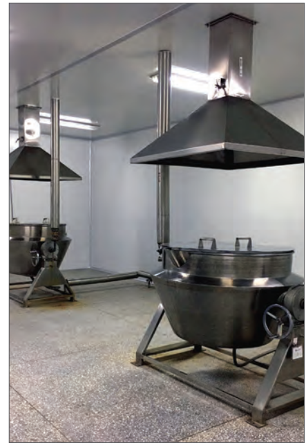
HERBAL PROCESSING EQUIPMENT AT A GMP EXTRACTION FACILITY IN CHINA

Classical Pearls has gone to great lengths to research traditional growing ( didao ) and preparation ( paozhi ) methods of ingredients and formulas. In addition, every formula is manufactured in certified GMP facilities under rigorous standards – both in China and the United States. With great effort, Classical Pearls personally selects and inspects the facilities that process and manufacture the formulas and single herbs. While the term supply chain management is often used by businesses to describe design, planning, execution, control, and monitoring of supply chain activities with the objective of creating net value, Classical Pearls undertakes such a task in order to ensure a high standard of quality in all of the ingredients in their products. As much as possible, the company maintains oversight, control, and management of every step of the process – from growing, cultivation and processing, to formulation, manufacturing, testing, and distribution. In addition, the recyclable amber glass bottles are used to inhibit light damage to the ingredients in their formulas, and as much as possible, help avoid the use of petroleum plastics during the packaging process.