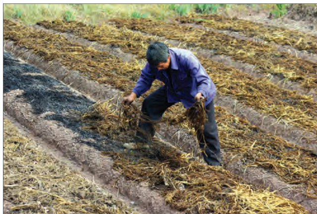
AN EXAMPLE OF DIDAO : A FIELD OF BAISHAO (WHITE PEONY) IN THE HERB'S TRADITIONAL GROWING REGION OF HANGZHOU, BEING ORGANICALLY PREPARED FOR THE GROWING SEASON AT ONE OF THE SMALL SCALE PARTNER FARMS OF CLASSICAL PEARLS

solstice, and then harvest the mature roots right just before the summer solstice. In this way, the prototypical yang tonic Fuzi absorbs only the energy of the expansive yang part of the year. Cultivated in this way, Jiangyou aconite roots grow to be three times as large as elsewhere in China and are considered to be safer and more potent at the same time. Since space is limited in Jiangyou County, and traditional methods of growing and processing the roots are labor intensive, 95% of Chinese aconite is nowadays produced in large scale plantations in Shaanxi, Yunnan, and other parts of Sichuan Province.