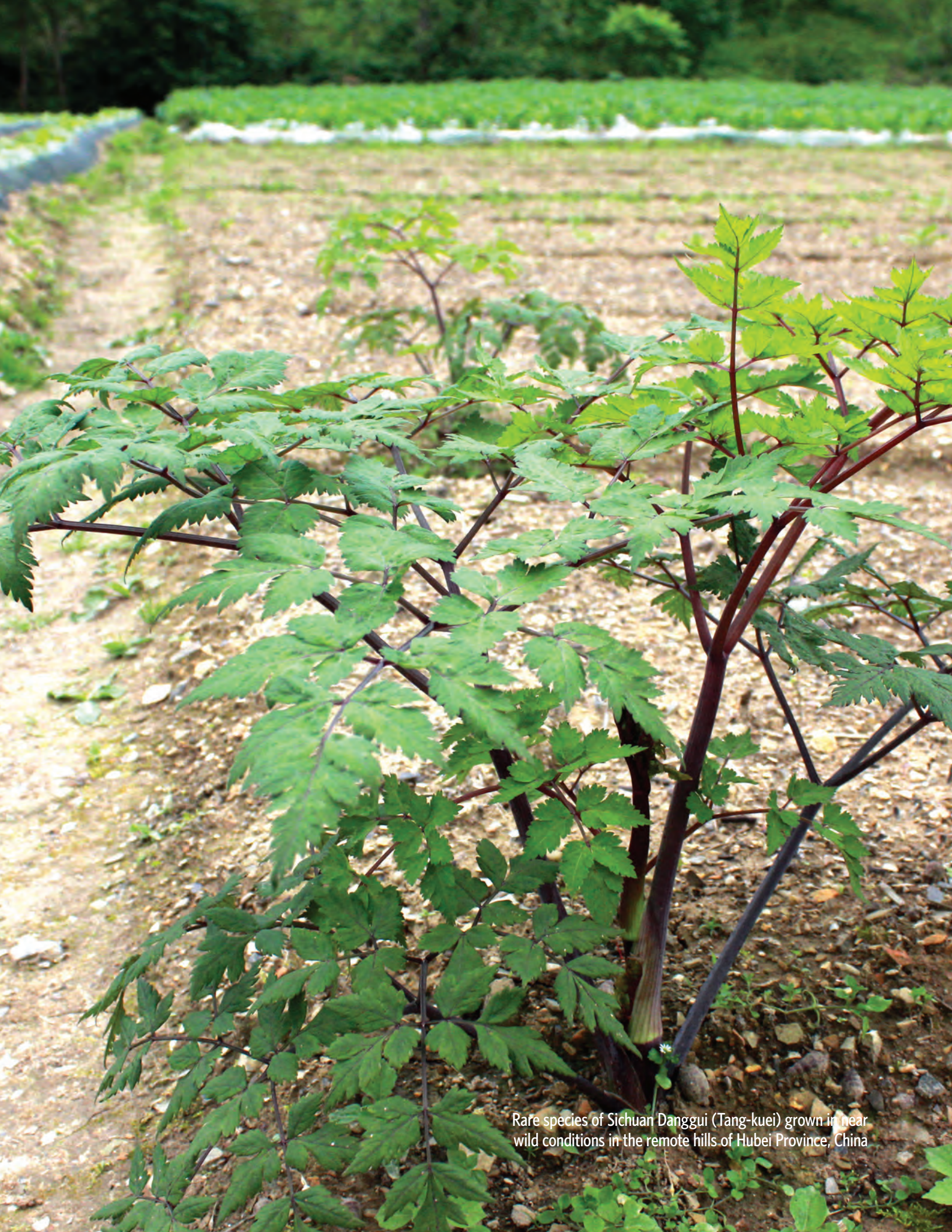
Rare species of Sichuan Danggui (Tang-kuei) grown in near wild conditions in the remote hills of Hubei Province, China