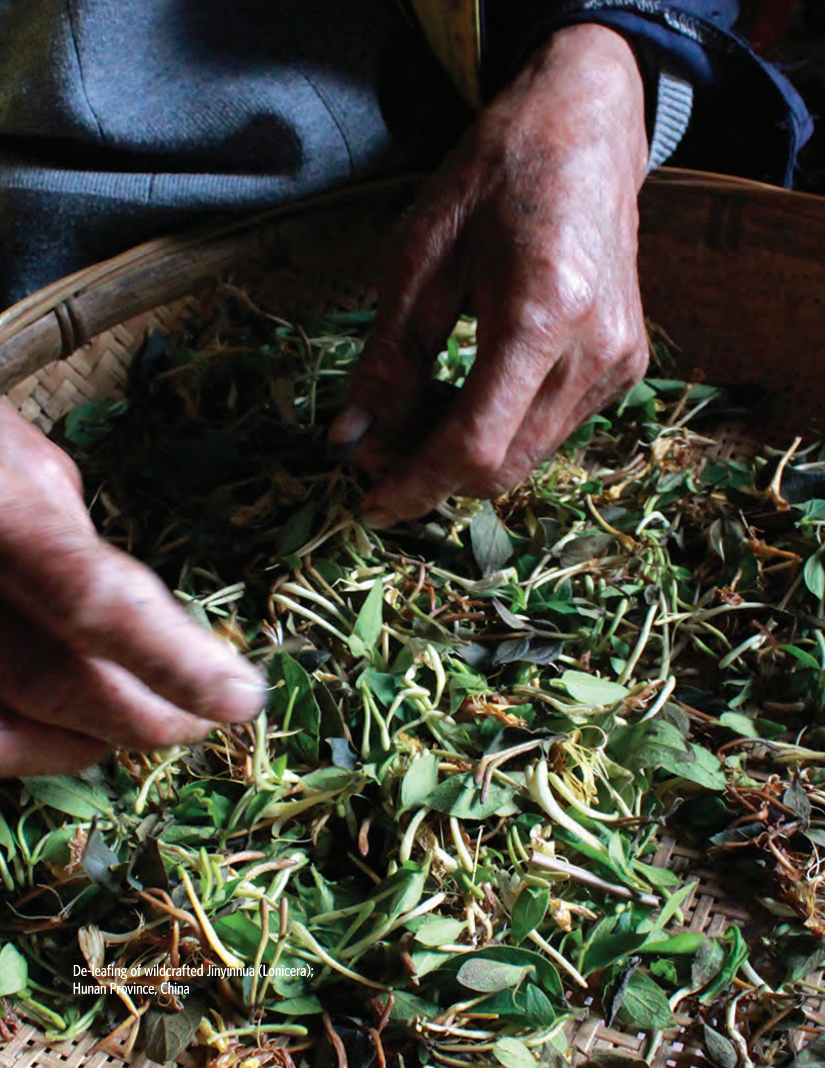
De-leafing of wildcrafted Jinyinhua ( Lonicera ); Hunan Province, China