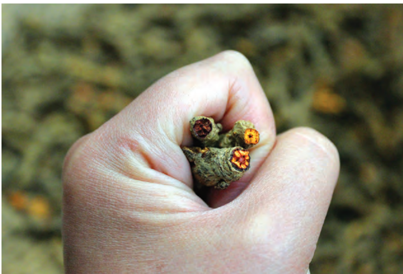
HUANGLIAN (COPTIS) FROM THE TERROIR SPECIFIC MOUNTAINS OF CHONGQING; NOTE THE "CHRYSANTHEMUM HEART" IN THE CENTER OF THE ROOT, AN INDICATOR OF GENUINE DIDAO BOTANICALS

Considering the uncertainty of materials being imported from China and other parts of the world, the goal of Classical Pearls is to maintain transparency in each step of the growing, harvesting, manufacturing, and testing processes for each of the raw herbs that make up their products. Classical Pearls is working on a system to make the safety and authenticity certificates for each product on the product detail pages of their website. You must have an account to view detailed information.