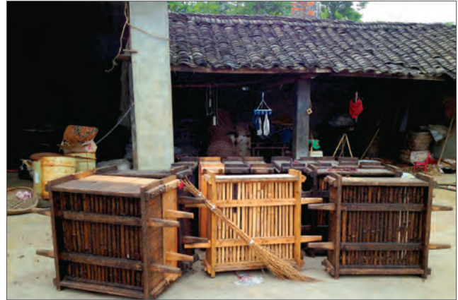
TRADITIONAL FUZI STEAMING BASKETS; JIANGYOU, SICHUAN REGION, CHINA