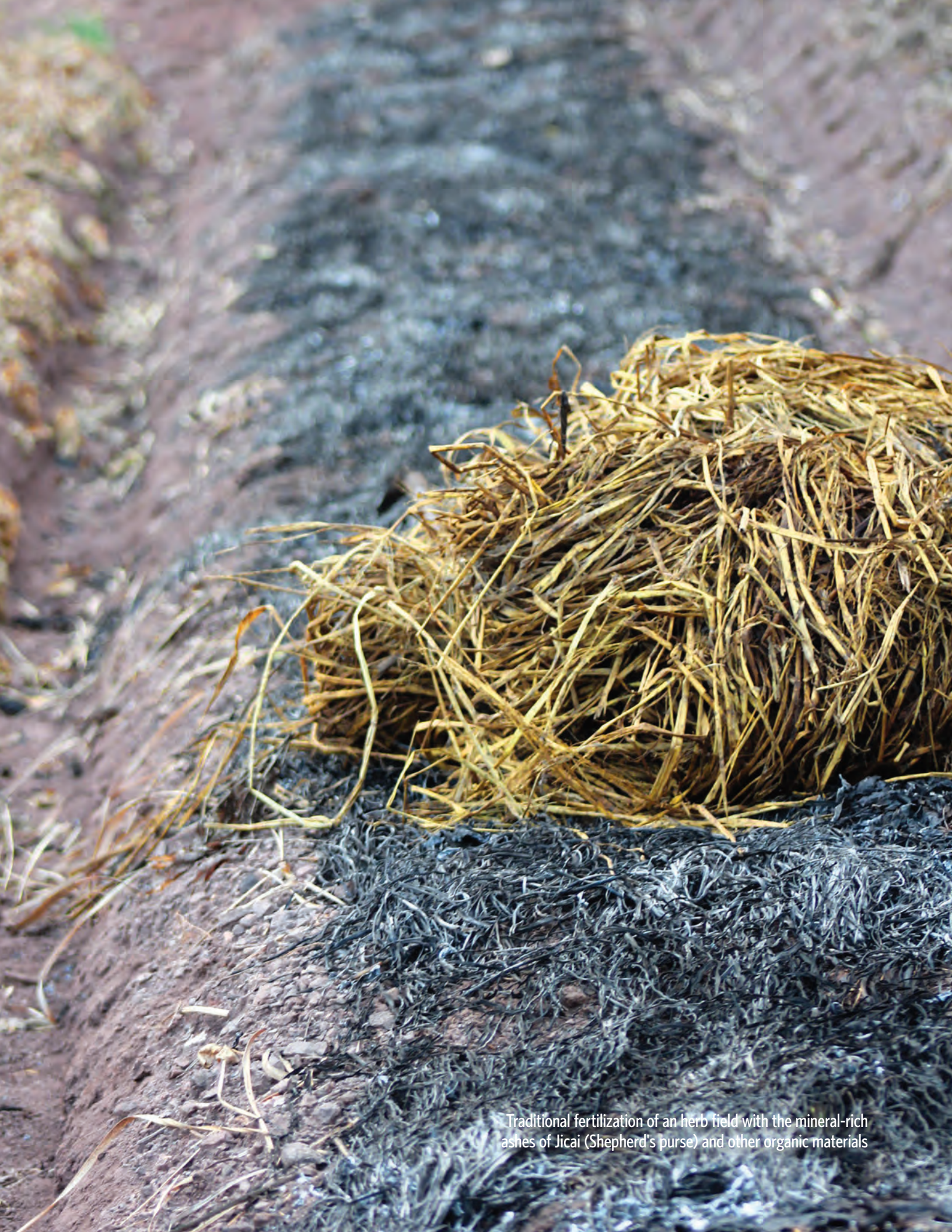
Traditional fertilization of an herb field with the mineral-rich ashes of Jicai (Shepherd's purse) and other organic materials