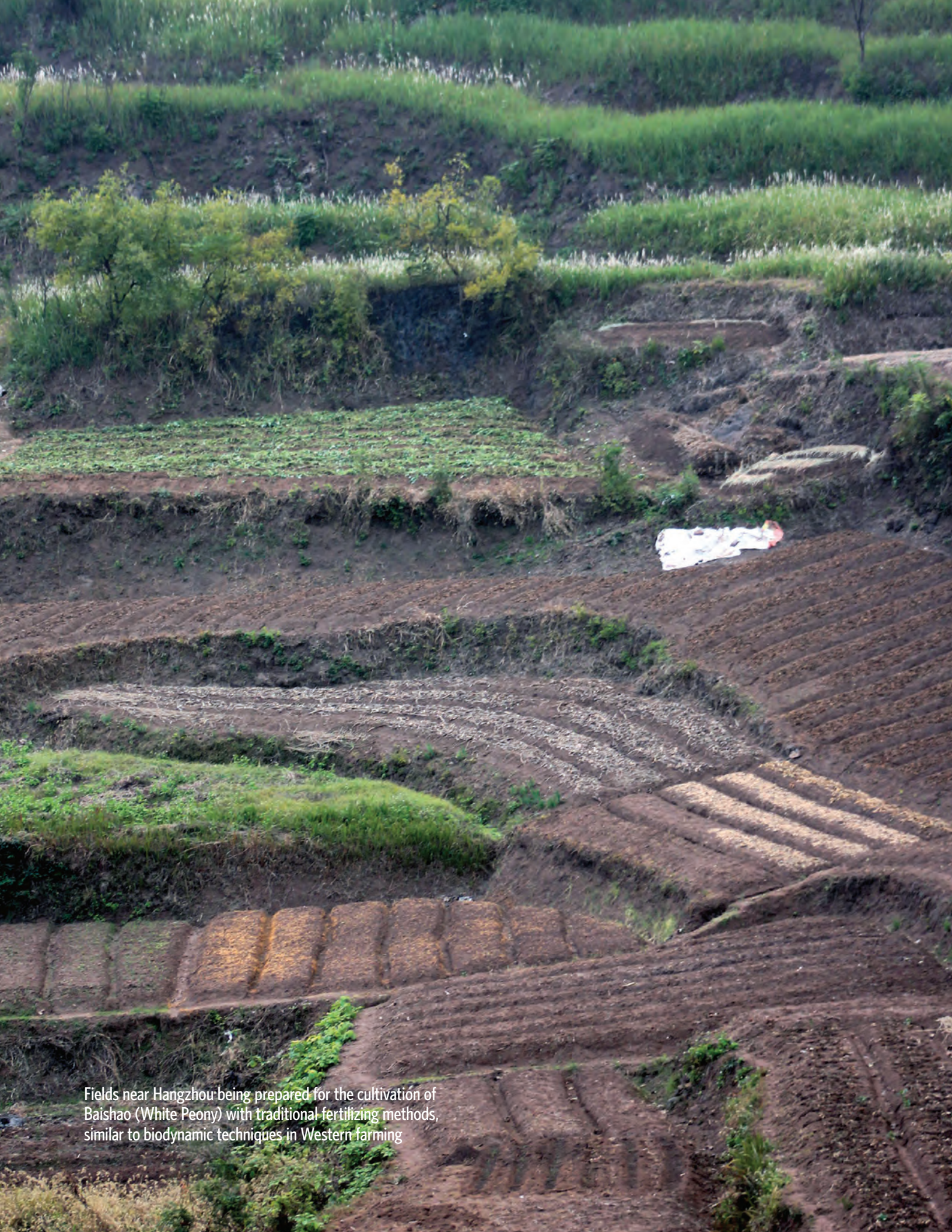
Fields near Hangzhou being prepared for the cultivation of Baishao (White Peony) with traditional fertilizing methods, similar to biodynamic techniques in Western farming