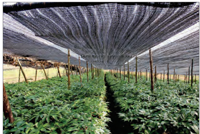
INSIDE A TENT THAT PROTECTS SANQI (PANAX NOTOGINSENG) FROM THE ELEMENTS

One of the best examples of how didao considerations can define and enhance the medicinal properties of a plant is aconite. More than 2,000 years ago Chinese observers of the natural world specified that only the aconite tubers cultivated around the region of today’s Jiangyou in Sichuan are of medicinal grade and thus worthy of being manufactured into the highly valued herbs Fuzi, Tianxiang, and Chuanwu. To further utilize the energetics of time, Jiangyou farmers collect aconite seedlings from the surrounding hills and plant them in the valley soil next to the River Fu right after the winter